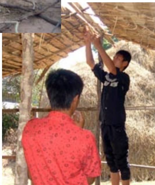
2. Fixing the roof

✚ Facilitators: (like Phanna above) live among the communities.