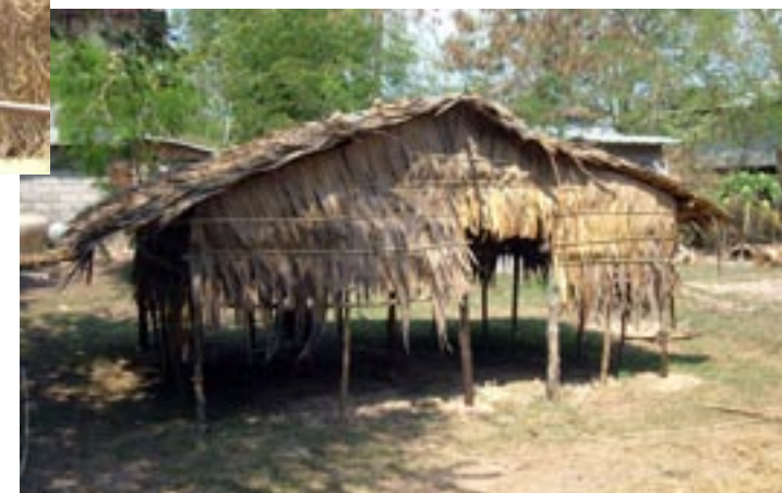
3. The finished chicken coop, made with the communities own resources

✚ VIDP works in 3 villages where there is a church but few or no other NGOs.