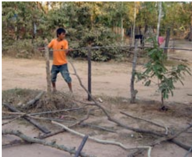
1. Laying out a chicken house frame

A new ICC run programme will be working in the villages, equipping and envisioning local church leaders to promote a better quality of life in the village; empowering them to bring about change in their communities and build relationship with their neighbours.