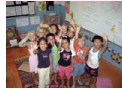
Nice to have small class sizes!